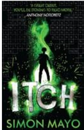
Itch by Simon Mayo

Why this story? Itch also faces ethical and moral dilemmas in this fast-paced adventure.