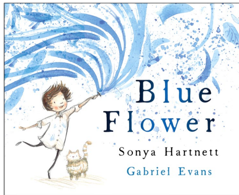
Blue Flower by Sonya Hartnett & Gabriel Evans

Why this story? Read another wonderful picture book by Sonya Hartnett with glorious illustrations by Gabriel Evans about finding beauty and difference in individuality. A story about self-esteem, resilience and the discovery that being different can be something wonderful.